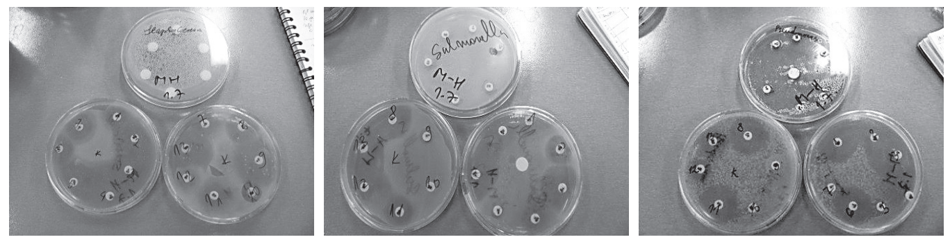
Figure 3. St. aureus

Cyprofloksacin induced the bigest zone of inhibition for the all three bacteria (Table 1). Good inhibitory effect was showed: cefotaksim, ofloksacin, azitromicin and tetraciklin, while amikacin, cefuroksim, gentamicin, eritromicin, penicilin, hloramfenikol, neomicin and vankomicin showed different effect depending on microorganism.