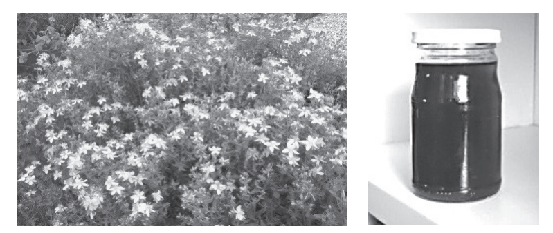
Figure 1. Hypericum perforatum L. and Oleum Hyperici

Hypericum perforatum L. (Hypericaceae) or St. John's Wort is one of the most popular medical plants worldwide. The genus Hypericum has about 400 species worldwide (Hickey et al., 1971). Hypericum perforatum L. is a perennial plant that bears extensive creeping rhizome with stem up to 1m high. The yellow flowers appear in broad cymes at the ends of the upper branches. Hypericum perforatum L. exhibits antibacterial, antiviral, antimycotic, anti-inflammatory and antidepressive activities (Singh Pal, 2006; Couceiro et al., 2006). Oleum Hyperici is obtained by maceration of the fresh flowering tops of Hypericum perforatum L. Hypericaceae (St. John's Wort) in olive, sunflower or wheat-germ oil exposed to sunlight for 40 days.